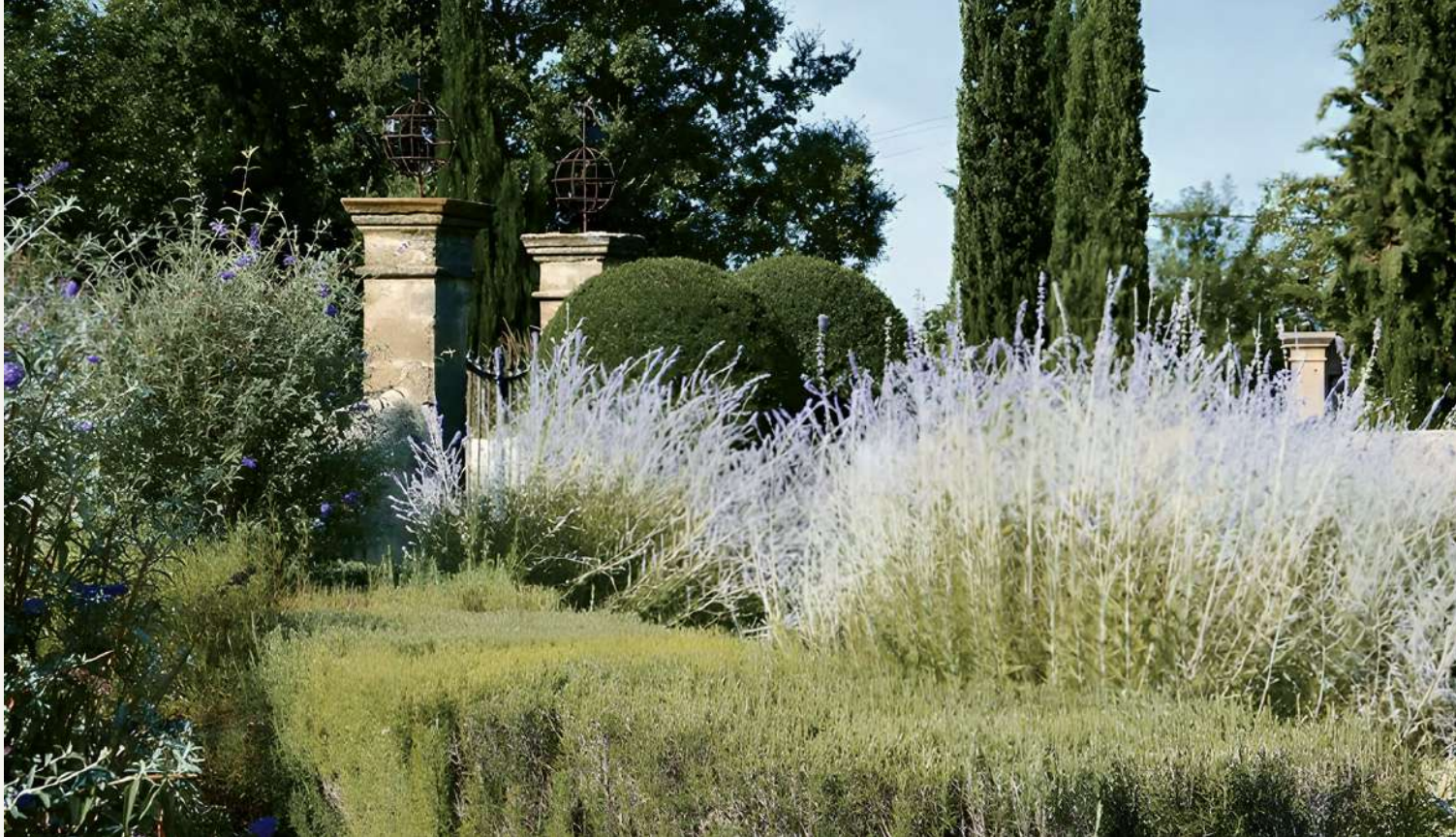
Pavillon de Galon