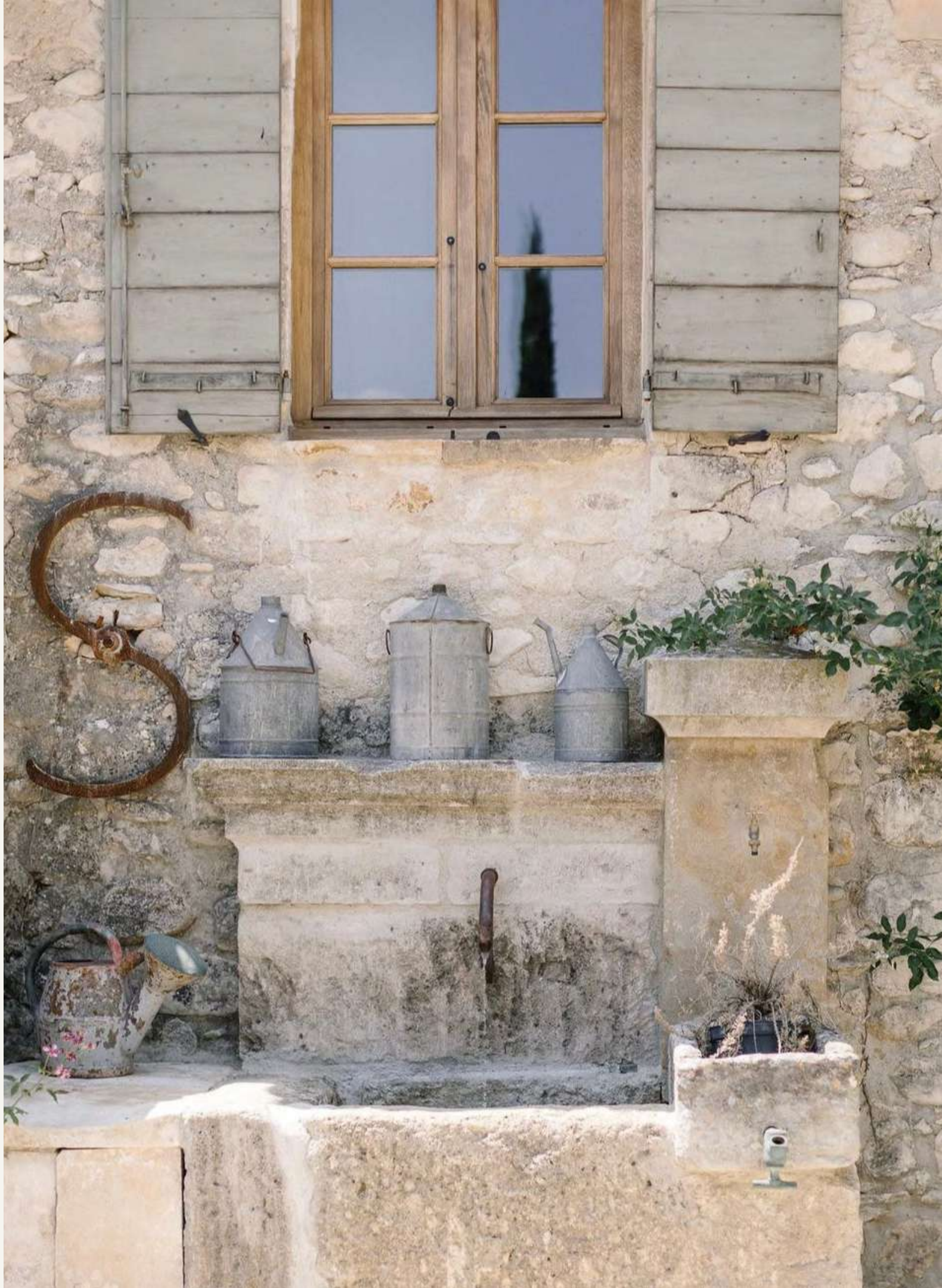
La Bastide de Marie