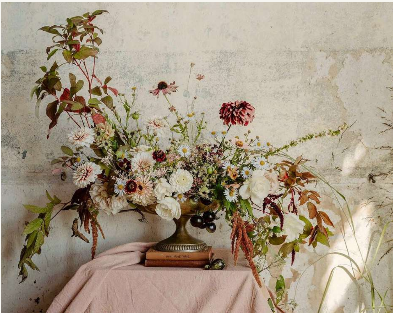
Lucy The Flower Hunter